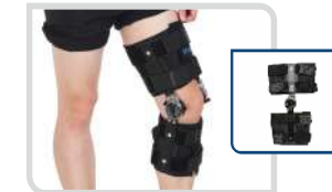
Knee Guard - ROM Rom Knee Brace Product Code - 15AGI31 Size : Universal