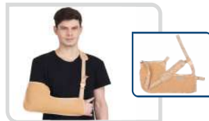
Arm Guard Arm Sling Pouch Product Code - 15AB113 Size : S, M, L, XL