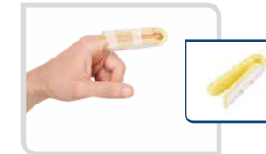
Finger Guard - Cot Cot Splint Product Code - 15AI131 Size : S, M, L