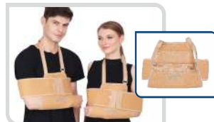
Shoulder Guard Shoulder Immobilizer Product Code - 15AB117 Size : S, M, L, XL