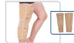
Knee Guard - Patella Knee Brace Covered Patella Product Code - 15AGI26 Size : S, M, L, XL