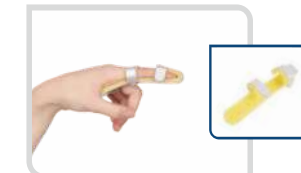
Finger Guard - Base Ball Base Ball Splint Product Code - 15AI120 Size : S, M, L