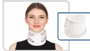
Cervical Guard - Hard Cervical Collar Hard Product Code - 15AAI15 Size : S, M, L, XL