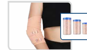
Bandage Guard Crape Bandage Product Code - 15AM1329 Size : 8cm, 10cm, 15cm