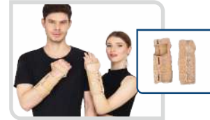
Wrist Guard - Cock Up Wrist Cock-Up splint Product Code - 15ACI18 Size : S, M, L, XL