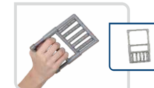
Finger Guard - Exerciser Finger Exerciser Product Code - 15AI137 Size : Universal