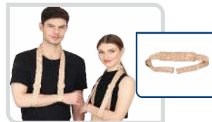
Arm Guard - Strap Arm Sling Strap Product Code - 15AB126 Size : S, M, L, XL