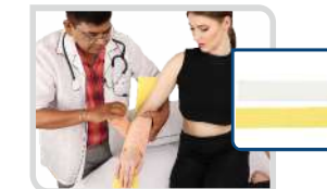
Long Arm U Guard Long Arm U Splint Product Code - 15AJ126 Size : Universal