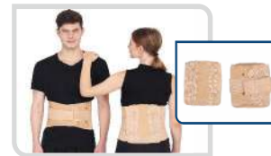
LS Guard Lumbo Sacral Belt Product Code - 15AEI14 Size : S, M, L, XL