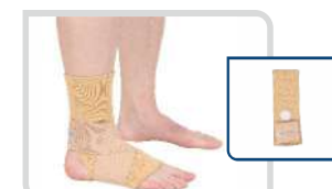
Ankle Guard Anklet with Ankle Binder Product Code - 15AH113 Size : S, M, L, XL