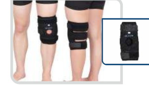
Patella Guard - Hinged Knee Support Patella Hinged Product Code - 15AG211 Size : S, M, L, XL