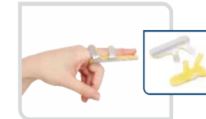
Finger Guard - Frog Frog Splint Product Code - 15AI120 Size : S, M, L