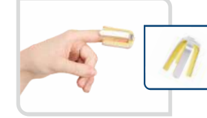
Finger Guard - Protector Protector Splint Product Code - 15AI1323 Size : S, M, L