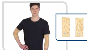
Elbow Guard Elbow Support Pair Product Code - 15AB135 Size : S, M, L, XL