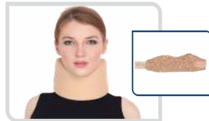
Cervical Guard - Soft Cervical Collar Soft Product Code - 15AAI21 Size : S, M, L, XL