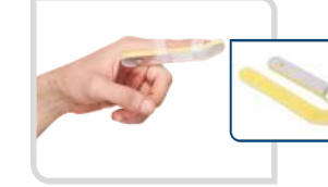
Finger Guard - Spoon Spoon Splint Product Code - 15AI122 Size : S, M, L