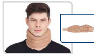
Cervical Guard - Eyelet Cervical Collar with Eyelet Product Code - 15AAI22 Size : S, M, L, XL