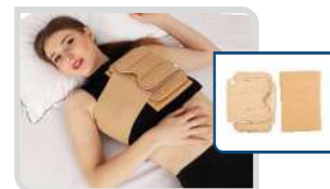
Chest Guard Sternal Splint Product Code - 15AD115 Size : S, M, L, XL