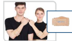
Tennis Guard Tennis Elbow Support Product Code - 15ACI10 Size : Universal