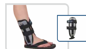
Ankle Guard - Support Ankle Support Product Code - 15AH2344 Size : Universal