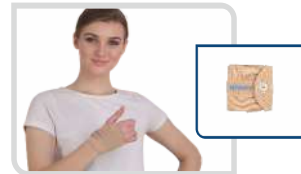
Wrist Guard - Thumb Wrist wrap with thumb hole Product Code - 15ACI36 Size : Universal