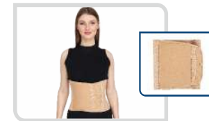
Abdominal Guard Abdominal Binder Product Code - 15AFI217 Size : S, M, L, XL