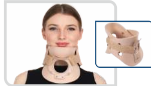
Cervical Guard - Philadelphia Cervical Collar Philadelphia Product Code - 15AAGI34 Size : S, M, L, XL