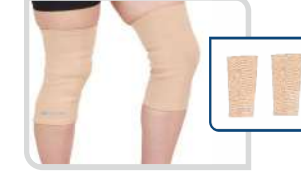
K Support Guard Knee Support Pair Product Code - 15AGI12 Size : S, M, L, XL