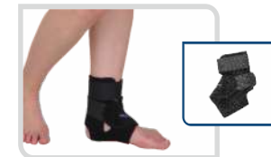
Ankle Guard - Brace Ankle Brace Product Code - 15AH2138 Size : S, M, L, XL