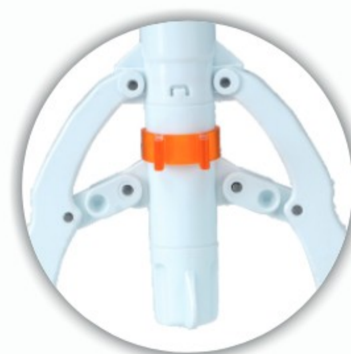
Single row with Multiple Pin