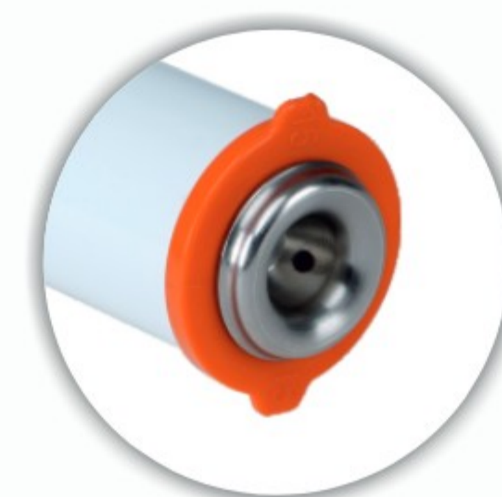
Diffirent Cup size