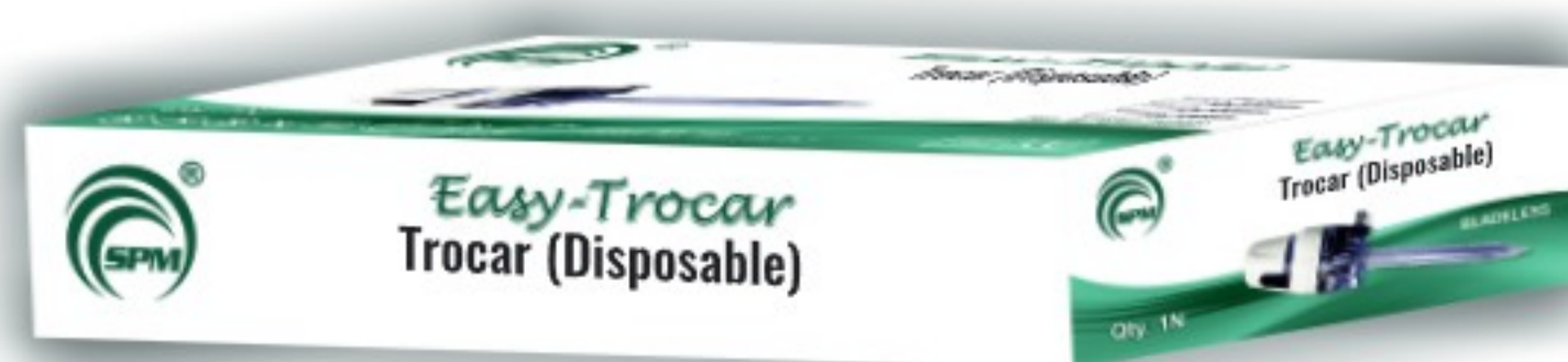
Individual Pack Inner box